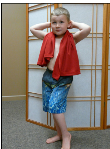
Yes, the swim diaper is truly under the suit. To be discreet and effective it must be adjusted correctly, and be as snug as possible.