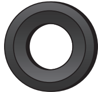
② Round Gasket