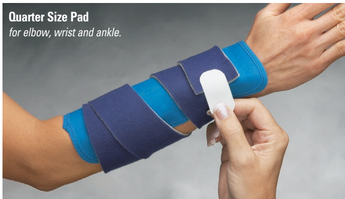
Quarter Size Pad for elbow, wrist and ankle.

For over thirty years, plastic gel packs put into covers have been the most convenient means of delivering cold therapy... until now.