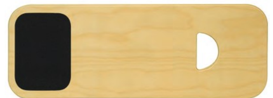
Transfer Board not included