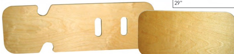
Perpendicular Hand Holes & Up/Down Notches