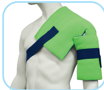
30100 Shoulder/Hip Wrap