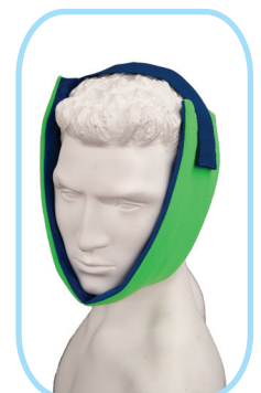
30109 TMJ Wrap