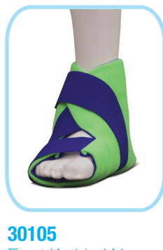
30105 Foot/Ankle Wrap