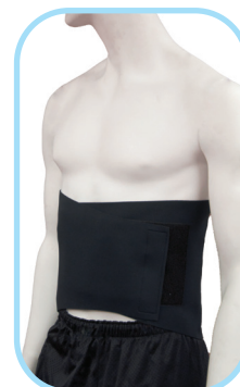
30108 Back Wrap