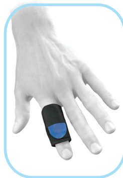
10303 (Small) 10304 (Medium) 10305 (Large) Finger Sleeve