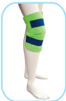
30103 (Standard) 30104 (Large) Arthroscopy Knee Wrap