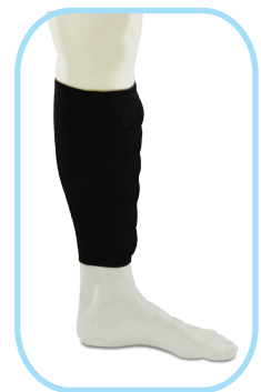
30011 (Small) 30013 (Large) 30012 (Med) 30014 (X-Large) Shin Wrap 30036 (Universal)