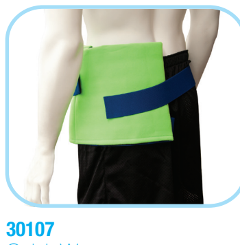
30107 Quick Wrap