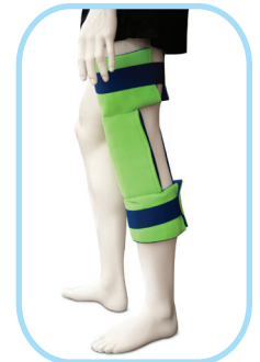
30102 CPM Knee Wrap